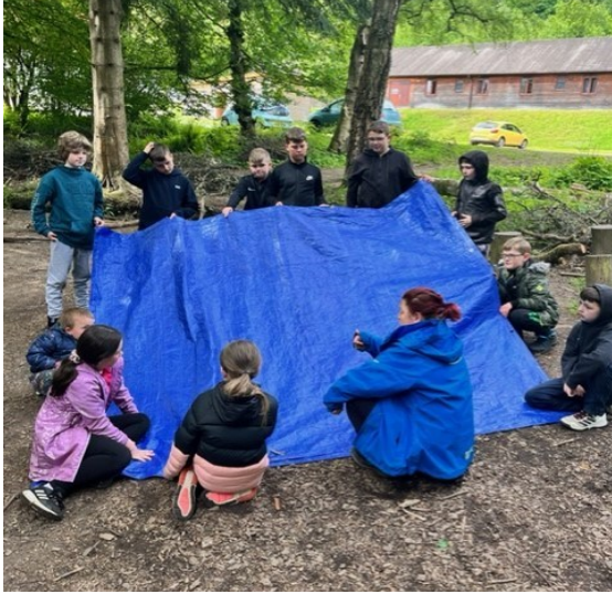
BB & GB members under canvas at Dalguse