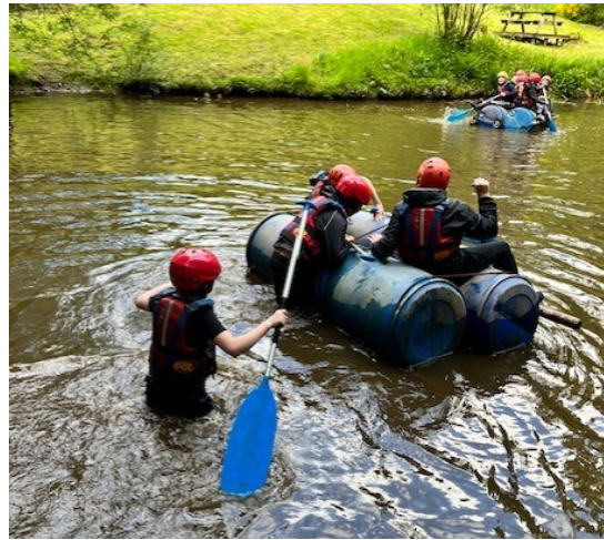
And under water by the look of it!